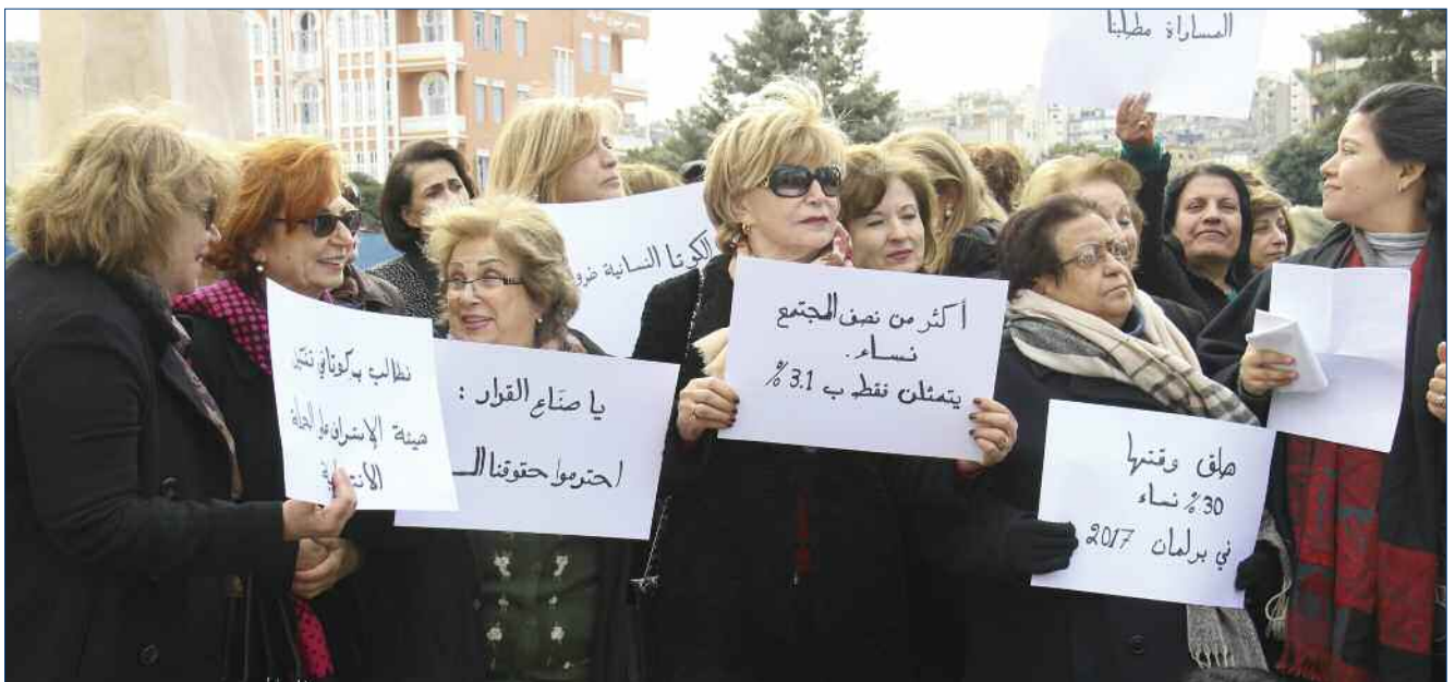
Lebanese civil society organizations are advocating policies which promote women's access to decision-making.

Women are invisible on the political scene in Lebanon. This diagnosis explores the reasons for this situation and proposes actions to strengthen the participation of women in political life at local and national level. Despite the efforts of civil society, further steps are needed to reverse this trend.