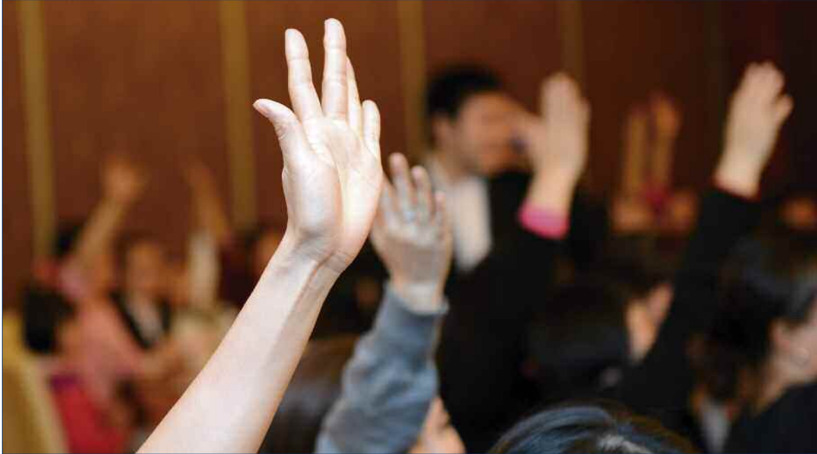
The lack of political power-sharing impedes the empowerment of Lebanese women and prevents them from being considered as full partners in the administration of the state and society.

to the majority of women in other parts of the Middle East and North Africa (MENA) region. Additionally, women in Lebanon appear to enjoy a greater sense of freedom when it comes to what they wear and social mobility and are more visible in the public sphere. However, a pervasive public presence stops short of participation by these women in leadership and decision-making and they are still invisible in Lebanese politics.