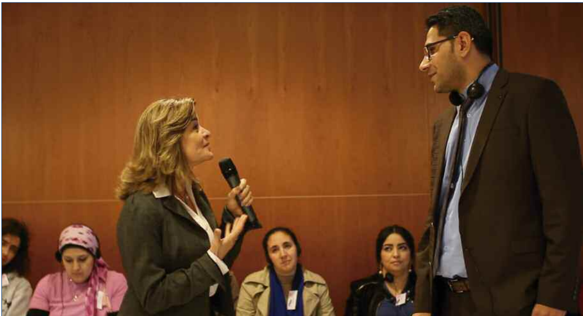
The Committee for the Follow-up on Women's Issues (CFUWI) gathered views from NGOs, members of municipalities and political parties on women's access to decision-making.